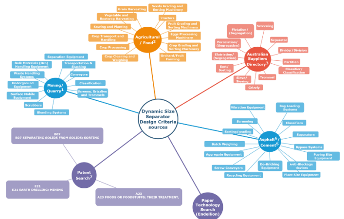
Figure 1 Dynamic Size Separator Technology Survey Sources

A dynamic separation system provides additional value to Grade Engineering® by creating additional operational flexibility and presents a disruptive technology currently not available, that could be quickly adopted across the industry.